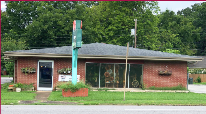
Street view of Simpson's Florist in Morgan County.