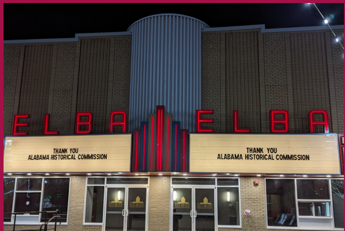
Elba Theatre marquee lit up with thanks to AHC.