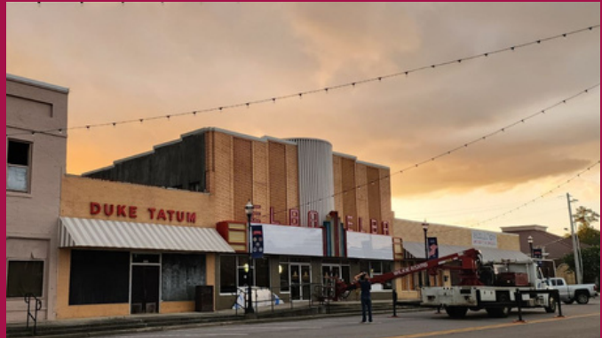
Installation process begins at Elba Theatre.