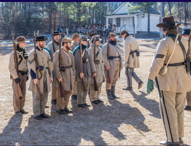
Demonstrators perform drill at Winter Quarters 2023.

Admission during the Winter Quarters living history day is $2 per person and an additional $2 admission for the museum. For information, call the museum at 205-755-1990.